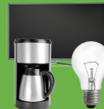
TV, Lights, Coffee Maker, etc.